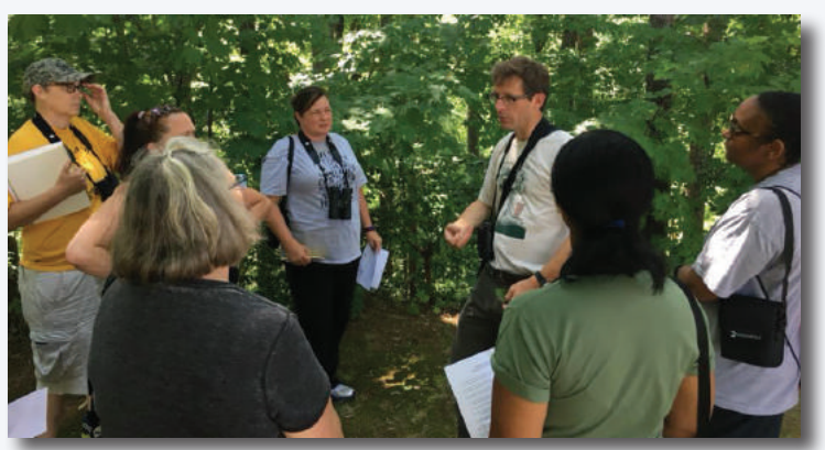
The Taking Wing teacher education program trains teachers how to teach students about birds and native plants.

The program was launched in 2012, and more than 140 educators have been trained through it, with an estimated engagement of 4,500 youth to