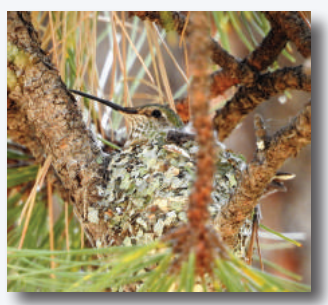
Nesting Broad-tailed Hummingbird.

we heard their calls as we walked along the path, the female stayed obscured in the trees and only once did the male come into clear view. After a full day exploring around the Fort, we winded down at the hummingbird feeders at Ash Canyon Lodge, where we had five species of hummingbirds including dazzling Lucifer's and Rivoli's Hummingbirds. We didn't get to see the Montezuma's Quail that had been frequenting the spot, partnaps because of the Northern Coschawle