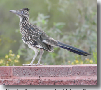
Greater Roadrunner, by Melanie Furn

Rufous-winged Sparrow. Before long, everyone was out in the parking lot with binoculars. Approaching monsoon clouds providing a cooling breeze as we watched fledgling roadrunners chase their parents around the hotel grounds.