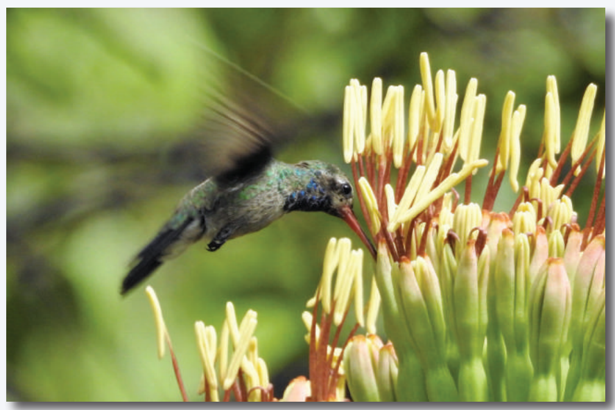
Broad-billed Hummingbird feeding on agave flowers

More information, complete itineraries, and registration for both trips can be found at www. atlantaaudubon.org/travel.