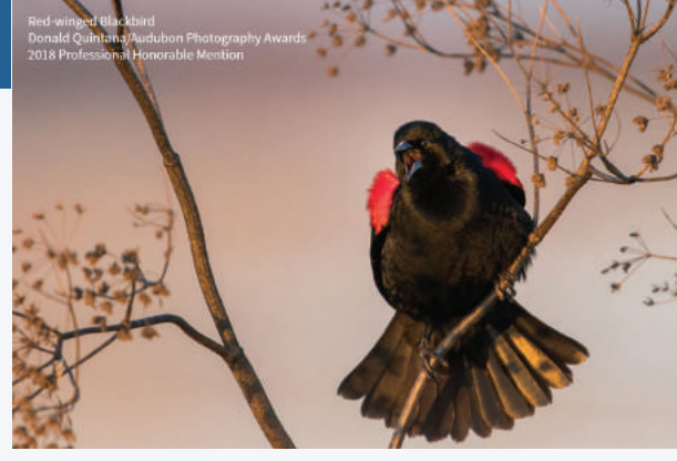
Join us for an exhibition of the Audubon Photography Award Winners at Brickworks Gallery on February 9, 2019. Red-winged Blackbird.

Selected from more than 8,000 entries, the winning photos were published in the Summer 2018 issue of Audubon magazine and show birdlife at its most vivid, vulnerable, formidable, and elegant. This year's exquisite photographs celebrate the splendor of many bird species protected under the 100-year-old Migratory Bird Treaty Act (MBTA), the most important bird conservation law, which is currently under siege in Congress and by the Department of the Interior.