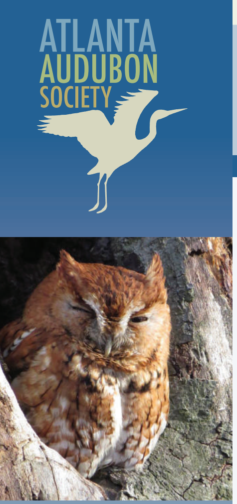
Eastern Screech Owl