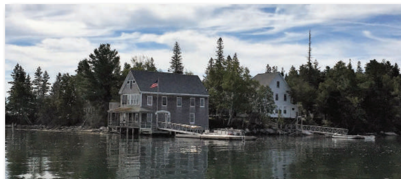
Atlanta Audubon is offering two scholarships for Hog Island Camps this summer.