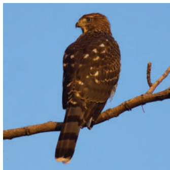
Raptor ID Workshop will teach you how to ID birds like this Cooper's Hawk.

FEE: Atlanta Audubon members: $40 Non-members: $50 Master Birders in Good Volunteer Standing: $35