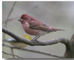
Purple Finch by Dan Vickers.