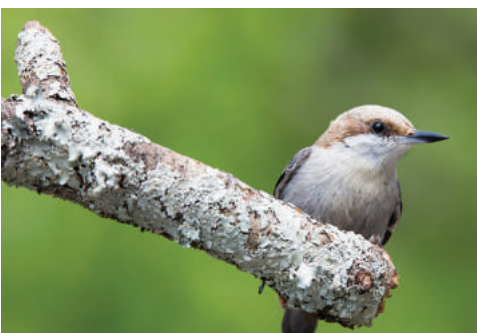
Brown-headed Nuthatch

You can learn more about the NAS Climate Report at http://climate.audubon.org/