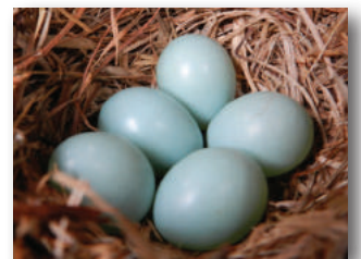
Bluebird nest with eggs.