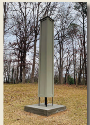
Atlanta Audubon will be constructing two 12-foot-tall Chimney Swift Towers along the Atlanta BeltLine, like this one at Henderson Park, thanks to a generous grant from Patagonia Atlanta.

Atlanta Audubon is excited to announce that it has received a grant from Patagonia Atlanta to construct two Chimney Swift towers along the Atlanta BeltLine in 2020. One tower will be located on the westside trail next to the Monday Night Brewing Garage, and the second tower will be located on the eastside trail near Ponce City Market. In addition to providing valuable nesting and roosting locations for the Chimney Swift, these towers will help Atlanta Audubon educate millions of Atlanta BeltLine visitors on the importance of birds and habitat conservation. The Chimney Swift is Atlanta Audubon's 2019-2020 conservation priority species, and these towers will bring the total number of towers we have installed to six. Listed on the IUCN Red List of Threatened Species as Vulnerable, Chimney Swift populations have plummeted in the past several decades due to increased pesticide use that harms their food source and due to loss of nesting and roosting habitat. Patagonia Atlanta has supported Atlanta Audubon's bird-friendly habitat restoration program at several sites, including Big Creek Greenway, Emma Wetlands, the Confluence of the North and South Forks of Peachtree Creek, Deepdene Park, and Friendship Forest.