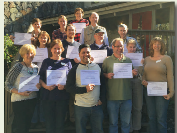
Master Birder class of 2015.

Saturday, February 22: 10:00 AM until 3:00 PM – Orientation and first class at Atlanta Audubon Saturday, February 29: 8:00 AM until 3:30 PM – Field trip at Cochran Shoals (CRNRA), class at Atlanta Audubon Saturday, March 7: 8:00 AM until 3:30 PM – Field trip to Dawson Forest, class at Dawson County Chamber of Commerce (Dawsonville, GA) Sunday, March 15: 8:00 AM until 3:30 PM – Field trip and class at Arabia Mountain Nature Preserve (DeKalb County) Saturday, March 21: 8:00 AM until 3:30 PM – Field trip at Murphey-Candler Park, class at Atlanta Audubon Saturday, March 28: 10:30 AM until 1:00 PM – Final exam and graduation lunch at Atlanta Audubon