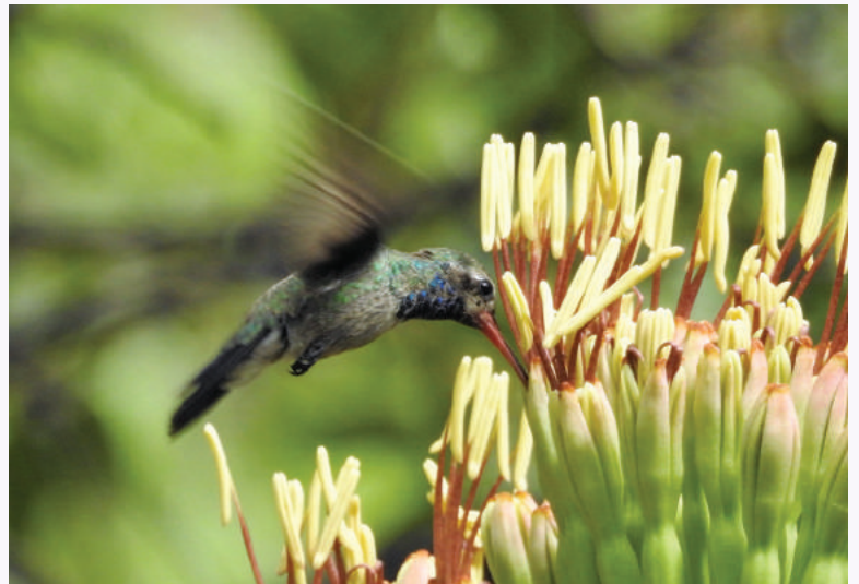
Broad-billed Hummingbird at agave flower