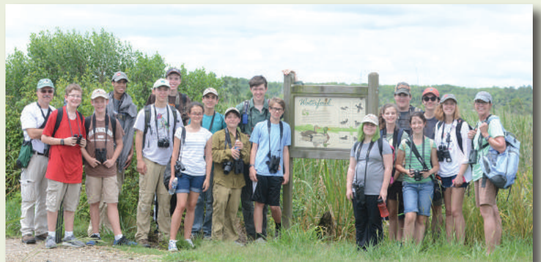
Camp TALON is for teens ages 14 to 19 who are interested in birds and birding.

Camp TALON is sponsored by the Georgia Department of Natural Resources, TERN, the Georgia Ornithological Society, and Atlanta Audubon. Early Bird registration is available through April 3. For more information or to register, visit https://georgiawildlife.com/CampTALON .