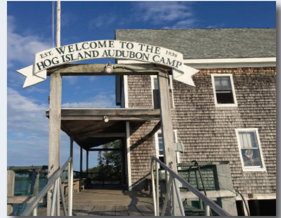
One lucky student and one educator will have the opportunity to attend the Hog Island Audubon Camp in Maine during summer 2020.