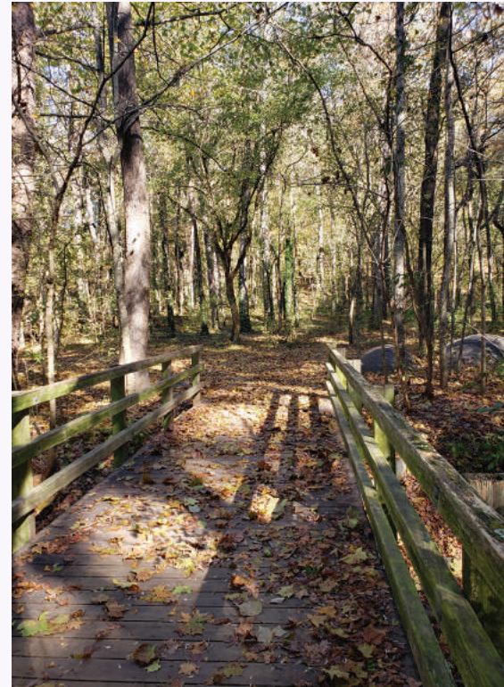
Atlanta Audubon will restore bird-friendly habitat at Cascade Springs Nature Preserve through a grant from the NFWF Five Star and Urban Waters program.

Wildlife Service, FedEx, Southern Company, Shell Oil Company, and BNSF Railway. The goal of this grant program is to develop community capacity to sustain local natural resources by providing modest financial assistance to diverse local partnerships for wetland, forest, riparian, and coastal habitat restoration, as well as stormwater management, outreach, and stewardship with a focus on water quality, watersheds, and the habitats they support. Forty-six projects totaling $1.7 million were awarded, leveraging $4.4 million in matching contributions from grantees, and generating a total impact of more than $6.1 million.