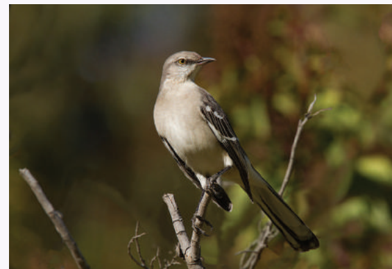
Northern Mockingbird, by Marlin Greene.

Territorial mockingbirds can certainly be a nuisance when they keep other birds from your feeders, but if all else fails, these birds are native residents, and there is a great deal of value in keeping our common birds common. Just sit back and enjoy the defensive displays!