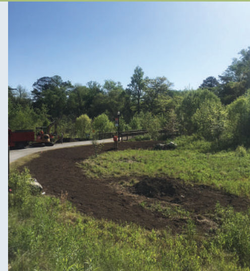
The Native Plant Demonstration Garden in Piedmont Commons will provide high-quality habitat for birds and wildlife and educate the public on the value of native plants.

The unveiling for the project is slated for September to coincide with the inaugural “Georgia Grows Native for Birds Month.” Please stay tuned for updates on the project, and for details about our ribbon-cutting celebration this coming fall.