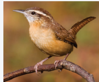
Carolina Wrens are well known for building nests in unusual places.