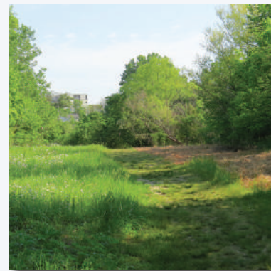
The Confluence is a tremendous habitat restoration success story.

The application deadline is August 31, 2018. One project will be chosen by committee and announced at the end of October. To learn more about eligibility, criteria, and schedule for this new opportunity, please go to www.atlantaaudubon.org/habitat-restoration-fund.html .