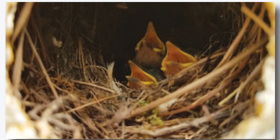
Carolina Wren babies.

She said that raising and caring for baby birds turned out to be great preparation for being a parent herself, that you learn when to help, when to hold on, and when to let go. Watching the Carolina Wren parents guide their young around the yard, showing them how to forage for themselves, and now suddenly seeing them visiting our feeders and planters on their own made me feel so proud for the mama and papa.