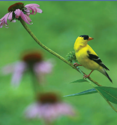
Goldfinch on coneflower stem, by Dan Vickers

At the end of April, Atlanta Audubon broke ground on a Bird-friendly Habitat Educational Exhibit in Piedmont Park. As the excavation began, I was greeted by my first-of-the-year Blue Grosbeak perching fortuitously in the site. The "Exhibit," located in the Piedmont Commons beneath local brewery Orpheus's balcony, will feature a Native Plant Demonstration Garden as well as a 24-foot-tall Chimney Swift Tower—Georgia's first. The project is a cooperative effort between Atlanta Audubon Society and Piedmont Park Conservancy and was originally made possible by a generous donation from a private individual. The project is being fully funded by Atlanta Audubon Society thanks to this donation, as well as a National Audubon Plants for Birds Burke Grant.