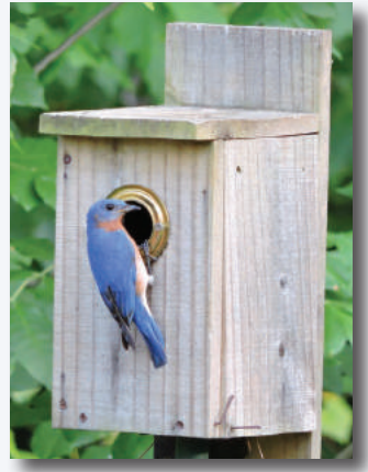
Male Eastern Bluebird on a Nestbox.

The Eastern Bluebird is a native, yearround bird in Georgia, and I know it's one that encourages a lot of us to learn more about the birds in our landscape. I am thrilled each spring to see a pair build a nest in one of my boxes. During the winter, I put out suet for them and a few mealworms, especially on very cold days, but during the spring and summer I let my plants provide for them.