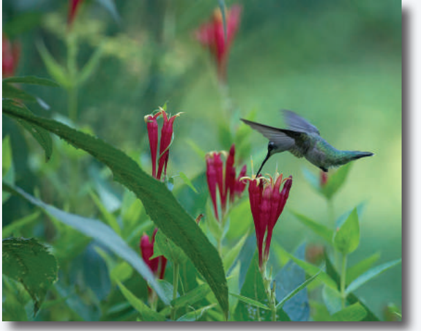
Ruby-throated Hummingbird on Indian Pink, by National Audubon Society.