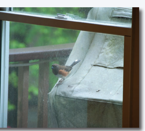
The perpetrator poised for the next attack.