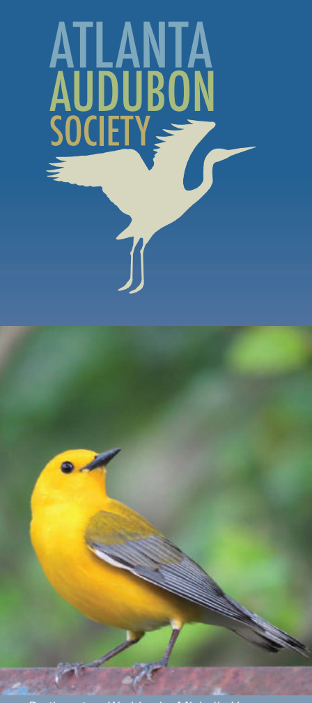
Prothonotary Warbler