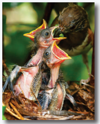
A nest full of Eastern Towhees

newly-fledged babies. This isn't easy but it is a worthy challenge, and you will learn much along the way. When the House Wrens stake claim to your nest box, give them some study and report your findings. Monitor them safely and consciously. Be active with community science, visit parts of the city or state that maybe you haven't in the past, and enjoy the excitement and energy that flows from this summer season.