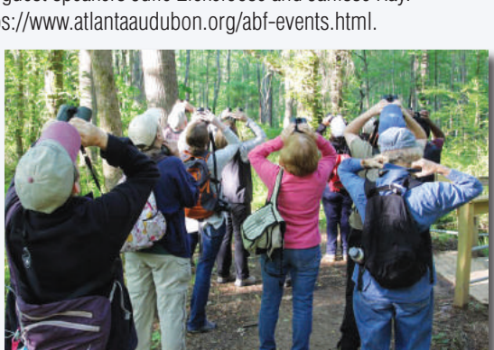
Participants explore the hardwood forests at Serenbe during Atlanta Bird Fest 2016.

Please visit www.atlantaaudubon.org/atlantabird-fest for more information and to preview the full schedule of events.