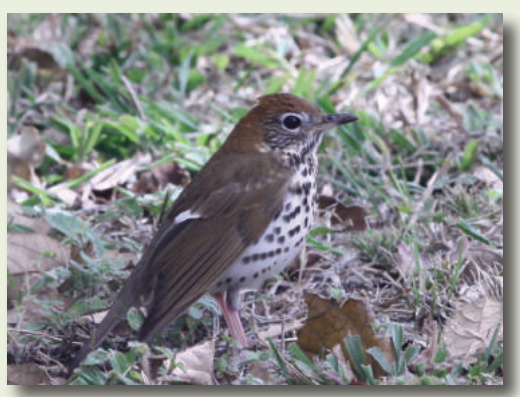
Wood Thrush, by Mary Kimberly

The flute-like call of the Wood Thrush has been disappearing from Georgia's forests over the past several decades because of multiple threats, including building collisions, habitat degradation, and climate change.