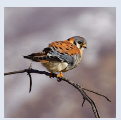
The Migratory Bird Treaty Act protects more than 1,000 species of birds, including American Kestrels.

2018 is officially the Year of the Bird, and Atlanta Audubon is partnering with the National Audubon Society, National Geographic, the Cornell Lab of Ornithology, BirdLife International, and many other organizations to declare 2018 "Year of the Bird." Through 12 months of storytelling, science, and conservation, we'll celebrate the wonder of our feathered friends, examine how our changing environment is driving dramatic losses among bird