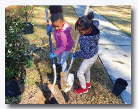
First graders dig into the new garden at Continental Colony Elementary School.

Thanks to the school communities at Boyd and Continental Colony elementary schools for their partnership in this year's project and to Convivial Gardens for leading our student crews.