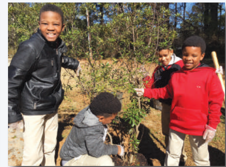
Planting native plants for birds and other wildlife at Boyd Elementary School.