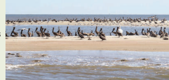
Don't miss the Shorebird Weekend on the Georgia Coast, May 3 through 5.