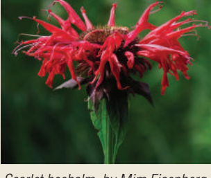
Scarlet beebalm, by Mim Eisenberg.

Native plants not only provide the highest-quality resources to wildlife, but have many benefits to people as well. Homeowners can save water by reducing lawn size, and the added plants can even help control flooding. Native plants are hardy and well-adapted, so thrive without synthetic fertilizers and pesticides, which hurt our pollinators, reduce prey availability, and can run off into streams. Finally, native plants and the wildlife they sustain provide color and beauty, right in your own back yard. We hope to see you at a plant sale this spring.