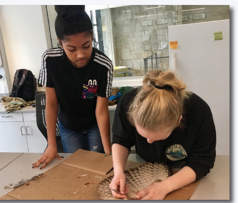
Students prepare a wing specimen from a Red-shouldered Hawk during Atlanta Audubon's session hosted at Oglethorpe University.

work with the specimens and did an excellent job preparing wings from a Red-shouldered Hawk and Barred Owl.) Paddling on the Chattahoochee River is always one of the highlights for students in the first-year program, ending with a pizza picnic at the Chattahoochee Nature Center, where we celebrate everyone's unique accomplishments. (Sadly, this year the canoe trip, as well as our bioblitz and campfire celebration for the second-year students, is canceled because of the current situation with the COVID-19 virus, but we hope to hold a celebration for all of the students when it is safe to do so.)