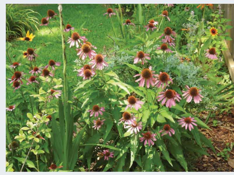
Purple coneflowers, by Dottie Head.

Order today at www.atlantaaudubon.org/plant-sales.