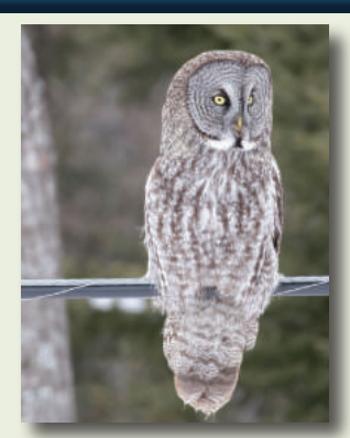
Great Gray Owl

For more information or to register, visit www.atlantaaudubon.org/minnesota.