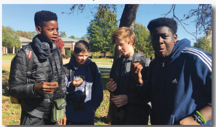
Students sample persimmons, a favorite coyote food, on the Berry College campus during a session hosted by Atlanta Coyote Project.

also partnered with Gardens for Growing Community, a local organization that supports nature-based learning for grades K-12 that has supported and facilitated the participation of several students of color from parts of Gwinnett. Often with limited opportunities to get outside and explore, these students light up when they peer through binoculars at their first Eastern Bluebird or visit the zoo for the first time. In addition, several motivated students apply for the program after learning about it on our website or social media. Combined with students from the Buckhead/North Atlanta community where our office is located, our Atlanta Urban Ecologists represent a wide spectrum of backgrounds and perspectives, but they all graduate from the program with a greater awareness of the amazing biodiversity right outside their doors, as well as of the opportunities for them in the field of conservation.