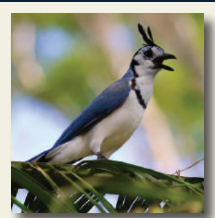
White-throated Magpie

\\/ith more species than the United States and Canada combined, our neighbors to the south host a truly breathtaking diversity of bird life. In addition to the wealth of natural life, Mexico is a nation steeped in rich history, culture and diversity, and it is a known culinary destination. While worthy sites can be found throughout this nation, Oaxaca stands out as a location overflowing with the things that make Mexico so special. With a bird species list approaching 800, Oaxaca is Mexico's most avianrich state. During this nine-day tour, we will split time between the Valley of Oaxaca, including Oaxaca City, as well as Hualtuco