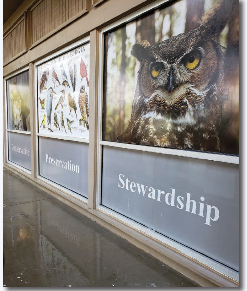
CollidEscape Window Treatment at Sawnee Mountain Preserve.