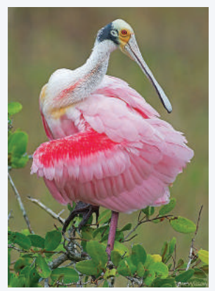
Roseate Spoonbill

A course fee of $425 includes classes and guided walks, course materials, and the graduation luncheon. Registration is now open at www.atlantaaudubon.org/ master-birder-program.