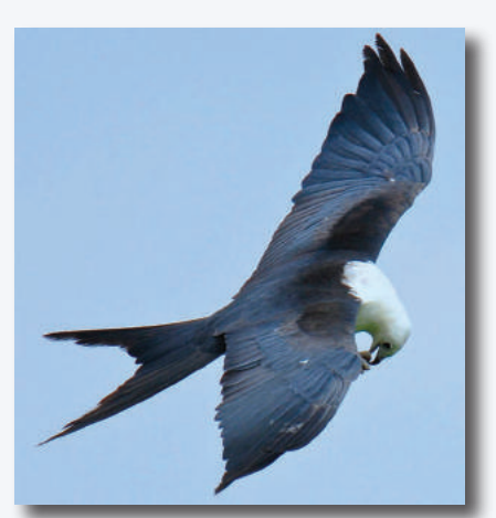
Swallow-tailed Kite in flight