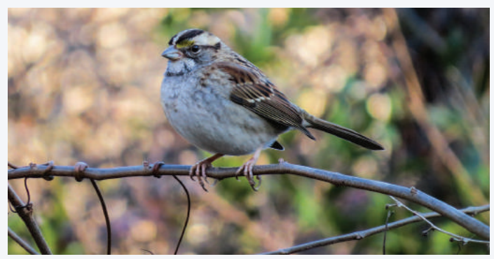
White-throated Sparrow