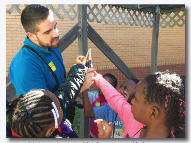
All of the students wanted their fingers measured for band size.