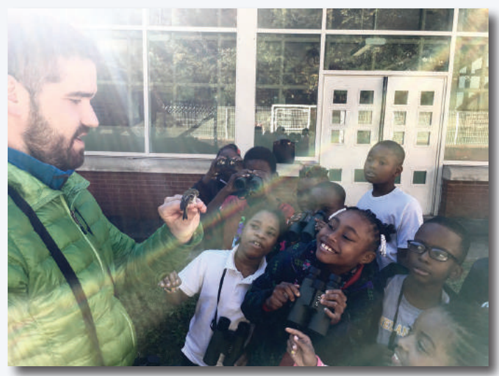
Students were excited to get an up-close look at a Golden-crowned Kinglet caught in the mist net.

they discovered all the bird life in their own schoolyard was a pretty satisfying way to spend the day. I think these excited faces say it all!