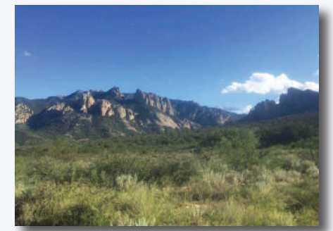
Southeast Arizona Landscape, by Ken Blankenship

Trip cost: $1,195 members*, $1,300 Non-members* *Based on double occupancy. Single supplement: Add $225. Price includes van transportation from the Tucson International Airport, five hotel nights with breakfasts, dinners, and four full-day guided field trips to hotspots including Saguaro National Park, Santa Catalina Mountains (Mount Lemmon), Madera Canyon, Florida Canyon, Paton Center for Hummingbirds, Hunter Canyon, Ash Canyon B&B, Huachuca Canyon, Garden Canyon, and more. For more information, e-mail Melanie Furr at melanie@atlantaaudubon.org.