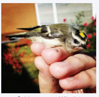
Golden-crowned Kinglet