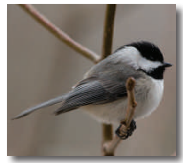
Carolina Chickadee, by Michelle Black.

Though COVID-19 put a kink in our Bird Fest plans this spring, we are pleased to announce that most events have been rescheduled for dates between September 19 and October 18. Bird Fest 2020 offers more than 40 events for bird and nature enthusiasts, including guided field trips, educational workshops, and guest speakers. It is one of our largest fundraising events each year, so your participation in and support of Bird Fest provide critical funds for habitat restoration, youth education programs, community events, species-specific conservation, and more. Registration for Bird Fest 2020 will re-open to Georgia Audubon members on Monday, August 10, and to non-members on Monday, August 17. Space may be limited in some events due to existing registrations from the spring. To learn more and to view the full schedule of events, please visit www.georgiaaudubon.org/birdfest.