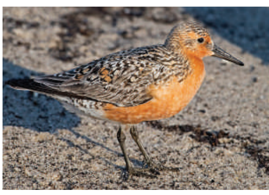
Red Knot in breeding plumage, by Brian Kushner.

According to the American Bird Conservancy, humans harvest horseshoe crabs for fertilizer and livestock feed, and for its rare blue blood, which is sensitive to endotoxins and is used to test