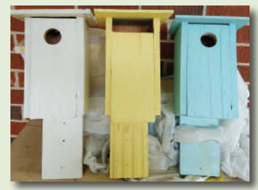
A selection of Donnie's hand-built bluebird boxes.

with more than 200 cut out and ready to assemble. At age 90, and with four decades of dedication to the Eastern Bluebird nesting boxes, he is undoubtedly Albany's official Bluebird Guru