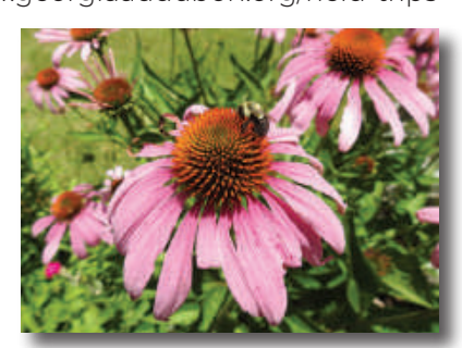
The 2020 Wildlife Sanctuary Tour will be a virtual event on Sunday, September 13.

See the complete listing on the back page of Wingbars.