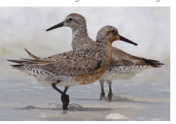
A pair of Red Knots in non-breeding plumage.

Like many birds, Red Knots were decimated by market hunting in the 1800s. Passage of the Migratory