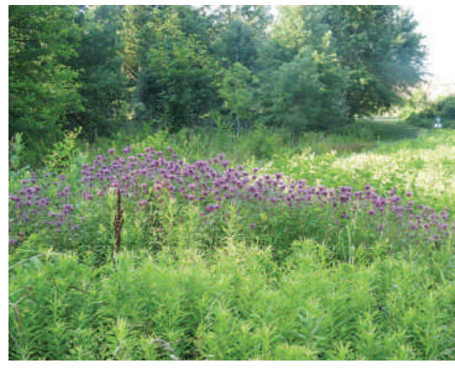
Purple Bee Balm at the Tapestry Community