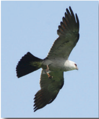
Mississippi Kite, by Dan Vickers.

If Mississippi Kites were circus performers, they might be the Flying Wallendas. If they were military pilots, they might be the Blue Angels. The printed page cannot adequately describe the aerial maneuvers these birds can perform, but if you'd like to see for yourself, search "Mississippi Kite Barrel Roll" on YouTube for a demonstration.