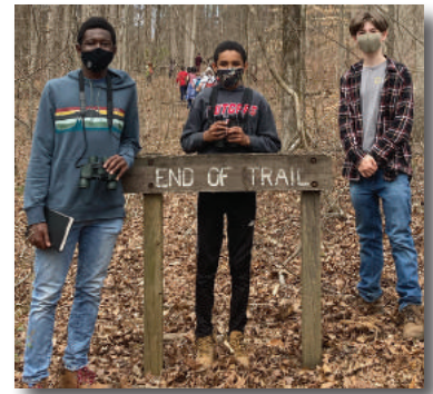
Three of our Atlanta Urban Ecologists pose on one of this year's outings.

So, while 2020 was not without its challenges and an unprecedented amount of stress, grief, and sorrow for so many affected by COVID-19, it has also had an unexpected reward in forcing us to take a close look at many of our programs and adapt them for larger, more diverse audiences. We cannot wait to get back to some in-person events, programs, and meetings and to begin interacting with people face to face, but we have also become adept at educating people remotely, allowing us to spread the joy of birds and birding further than we ever imagined would be possible.