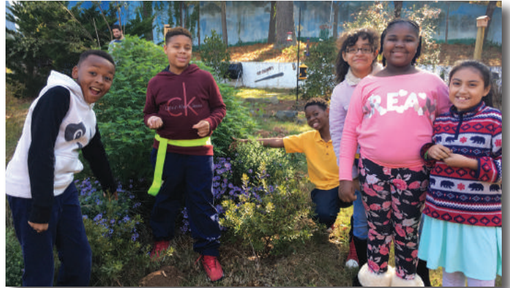
Hutchinson Elementary students help install a native plant garden at their school.

After being awarded a native plant garden from Atlanta Audubon Society (now Georgia Audubon), my students now have a hands-on approach to learning about native plants and birds and understanding how birds thrive. We have several types of bird feeders and nesting boxes. Some of the plants include beautyberry, aster, blueberry bushes, cherry laurel, and many different types of grasses. Students have set up a kiosk and created checklists with photos of the different birds and plants found in the garden for students, school staff, and visitors to use when they visit. Students also have access to field guides and binoculars provided by Georgia Audubon to help them identify birds found in the garden. Thanks to our ongoing partnership, Georgia Audubon staff comes out periodically to provide programming and take students