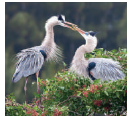
Great Blue Heron Rookery.

You've got a good camera but your bird photographs are not quite as good as you'd like. What makes a great bird photo? How do you take better bird photos? How do you make images of difficult subjects such as birds in flight or songbirds in a wooded area? How do the situations affect your choice of camera settings? Professional nature photographer Eric Bowles will guide participants in this two-part workshop to answer all these questions and provide tips and techniques to help you make better bird photographs.