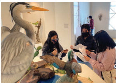
Atlanta Urban Ecologists made a visit to the Three Billion Exhibit at the Hudgens Center for Art and Learning in March.