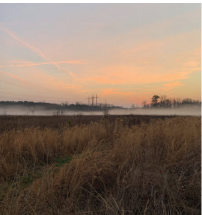
Power of Flight restoration area.