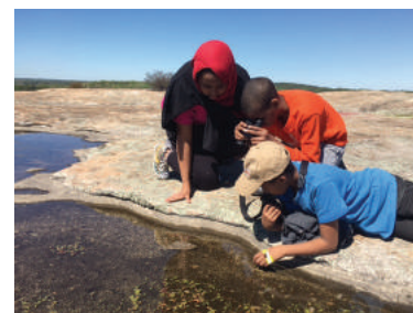
Atlanta Urban Ecologists explore one of the ephemeral pools on the top of Arabia Mountain.