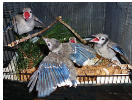
24- and 25-day-old Blue Jays treated by Pat.

When I asked Pat to tell me about one of her favorite bird friends, she immediately mentioned a Pileated Woodpecker. I happened to be at the shop the day a man showed up with two young woodpeckers that came from the cavity of a tree