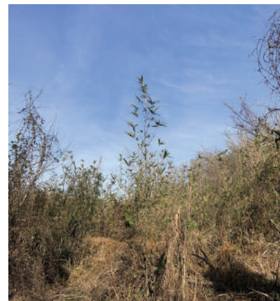
South River restoration area.

Finally, KEEN Inc. recently awarded its KEEN Effect Kids Grants to Georgia Audubon, one of nine organizations selected from an applicant pool of more than 400. This grant will be used to fund Georgia Audubon's Atlanta Urban Ecologists, a program that guides teens through an eight-month exploration of the fascinating, rich ecology of metro Atlanta, providing opportunities for hands-on field experiences, conservation, and community science, while also establishing a network of environmental professionals who can assist with their academic and career development.