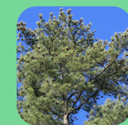
Loblolly Pine ( Pinus taeda ) Pine Warbler Carolina Chickadee American Goldfinch Tufted Titmouse