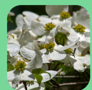
Flowering Dogwood ( Cornus florida ) Brown Thrasher Northern Cardinal Summer Tanager American Robin Cedar Waxwing