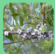
Wax Myrtle ( Morella cerifera ) Brown Thrasher Carolina Wren Tufted Titmouse Carolina Chickadee