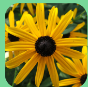
Black-eyed Susan ( Rudbeckia spp.) Indigo Bunting Eastern Towhee Tufted Titmouse Carolina Chickadee American Goldfinch