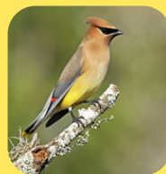
Cedar Waxwing Winterberry Dogwood Arrowwood Serviceberry Eastern Red Cedar