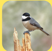
Carolina Chickadee Black-eyed Susan River Oats Eastern Red Cedar Tulip Poplar Wax Myrtle