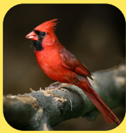
Northern Cardinal Smooth Sumac River Oats Dogwood Tulip Poplar American Beech