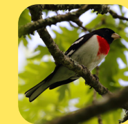
Rose-breasted Grosbeak Elderberry Tulip Poplar American Beech