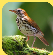
Wood Thrush Beautyberry Elderberry Dogwood Arrowwood Hearts-a-burstin'