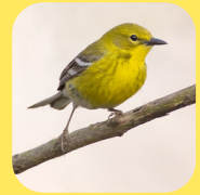
Pine Warbler Loblolly Pine Tulip Poplar Dogwood