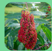
Smooth Sumac ( Rhus glabra ) Gray Catbird American Robin Brown Thrasher Northern Cardinal