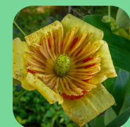
Tulip Poplar ( L. tulipifera ) Pine Warbler Northern Cardinal Tufted Titmouse Carolina Chickadee American Goldfinch