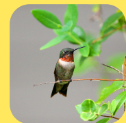
Ruby-throated Hummingbird Coral Honeysuckle Bee Balm Cardinal Flower Jewelweed