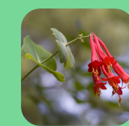
Coral Honeysuckle ( L. sempervirens ) Gray Catbird American Robin Brown Thrasher Ruby-throated Hummingbird