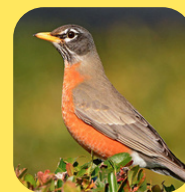
American Robin Beautyberry Dogwood Black Cherry Coral Honeysuckle Eastern Red Cedar