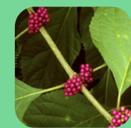
Beautyberry ( C. americana ) Brown Thrasher Northern Cardinal Summer Tanager American Robin Wood Thrush