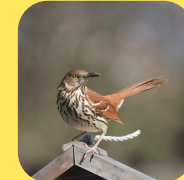
Brown Thrasher Beautyberry Elderberry Dogwood Black Cherry Muscadine