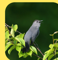
Gray Catbird Beautyberry Dogwood Black Cherry Muscadine Winterberry