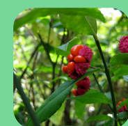
Hearts-a-bustin' ( E. americanus ) Gray Catbird Eastern Towhee Summer Tanager American Robin Wood Thrush