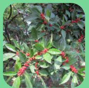
Winterberry ( Ilex verticillata ) Gray Catbird American Robin Cedar Waxwing