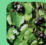
Muscadine ( Vitis rotundifolia ) American Robin Northern Cardinal Brown Thrasher Summer Tanager Carolina Wren