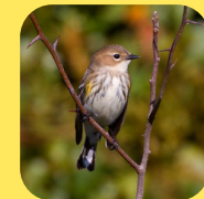
Yellow-rumped Warbler Wax Myrtle Tulip Poplar Dogwood Eastern Red Cedar