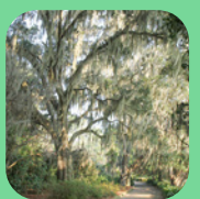
Water Oak ( Quercus nigra ) Brown-headed Nuthatch Yellow-rumped Warbler Tufted Titmouse