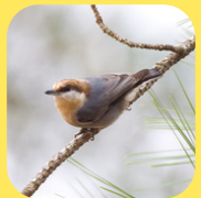
Brown-headed Nuthatch Loblolly Pine Sweetgum Eastern Red Cedar Water Oak