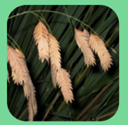
River Oats ( C. latifolium ) Indigo Bunting Northern Cardinal Tufted Titmouse Carolina Chickadee American Goldfinch