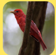
Summer Tanager Beautyberry Serviceberry Dogwood Arrowwood Black Cherry