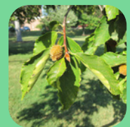
American Beech ( Fagus grandifolia ) Grosbeak Northern Cardinal Tufted Titmouse Carolina Chickadee