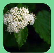
Arrowwood ( Viburnum spp.) Wood Thrush American Robin Summer Tanager Cedar Waxwing