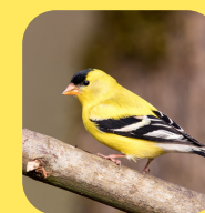
American Goldfinch Loblolly Pine Tulip Poplar Sweetgum Black-eyed Susan River Oats