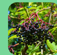
Elderberry ( S. canadensis ) Brown Thrasher Eastern Towhee Summer Tanager American Robin Wood Thrush