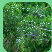
Eastern Red Cedar ( Juniperus virginiana ) Pine Warbler Northern Cardinal Tufted Titmouse Carolina Chickadee Cedar Waxwing