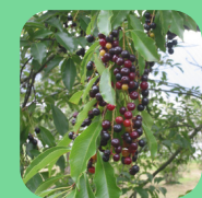
Black Cherry ( Prunus serotina ) Brown Thrasher Northern Cardinal Summer Tanager American Robin Cedar Waxwing