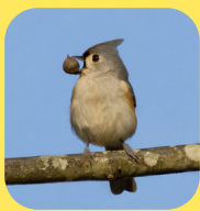
Tufted Titmouse Eastern Red Cedar Black-eyed Susan Water Oak Tulip Poplar Wax Myrtle