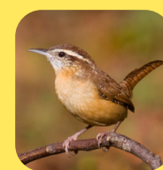
Carolina Wren Beautyberry Muscadine Eastern Red Cedar Wax Myrtle