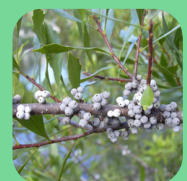
Wax Myrtle (Morella cerifera) Brown Thrasher Carolina Wren Tufted Titmouse Carolina Chickadee