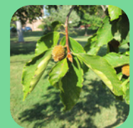
American Beech (Fagus grandifolia) Grosbeak Northern Cardinal Tufted Titmouse Carolina Chickadee